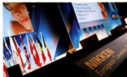
Nikken goes Dutch