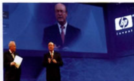
HP chooses London