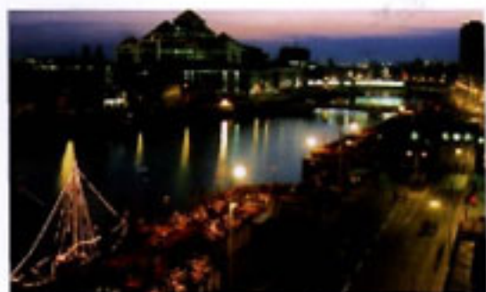
Microsoft in Dublin