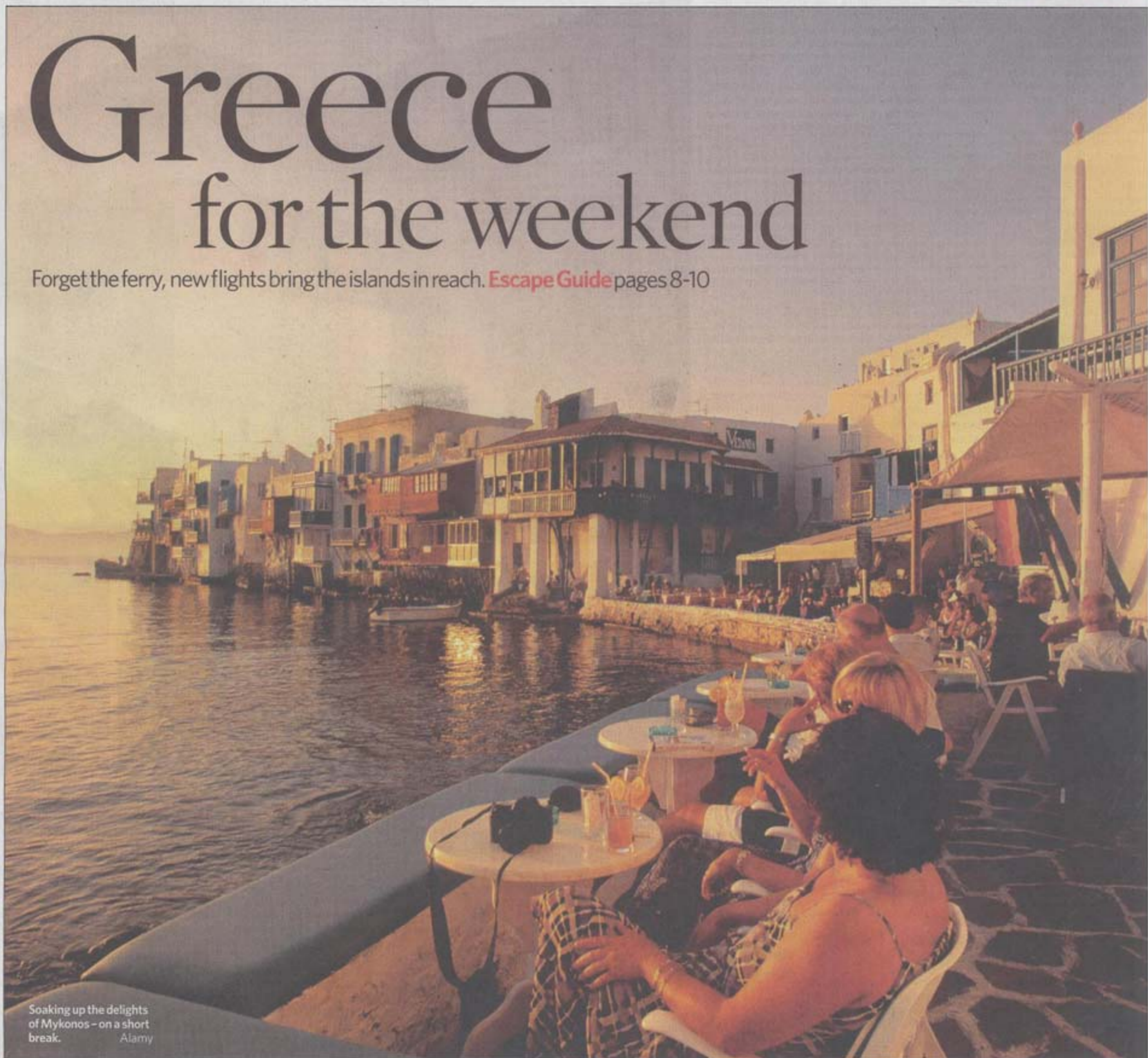
Soaking up the delights of Mykonos - on a short break.

Forget the ferry, new flights bring the islands in reach. Escape Guide pages 8-10